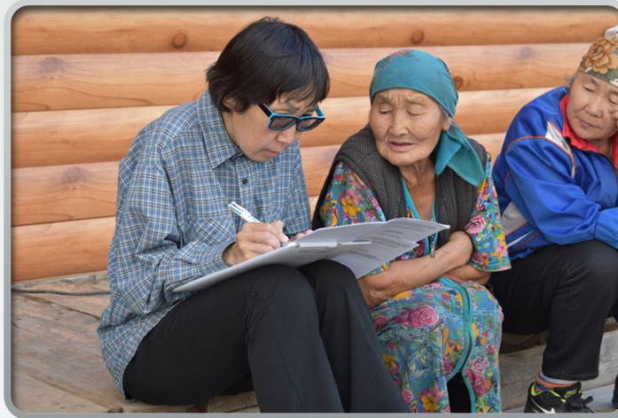
A scene of survey with a questionnaire. August 2018. Gornyi Raion

We want to make a questionnaire survey to grasp the local people's perception of climate change, the local environmental transformation and their living conditions.